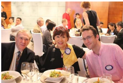
Fine dinner with experienced and young Rotarians and friends

Members: 14, Rotaracters: 0, Interacters: 0, Guests: 12 Contributions raised: RMB 1800 RMB