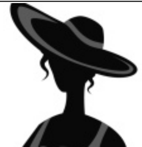
Agony Aunt – born and raised in a country far far away - has spent 17 years in Shanghai. She is familiar with all things Shanghaiese except the ones she is not familiar with. Her ageless beauty even exceeds her wisdom. She may look like 73 but Shanghai years count triple.

4. Will it be Beneficial to all Concerned? 是对大家有利吗? Shì Duì Dà Jiā Yǒu Lì ma?