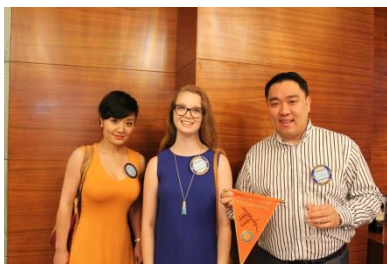
Fellowship with international guests from all around the world